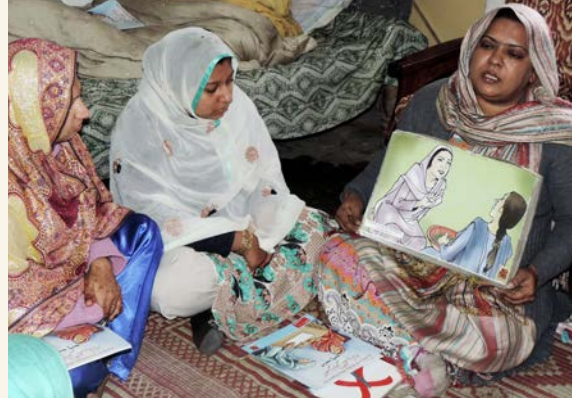
Financial trainings and business mentoring can improve the business successes of low-income women. Here, women receive training at Pakistan's Kashf Foundation.