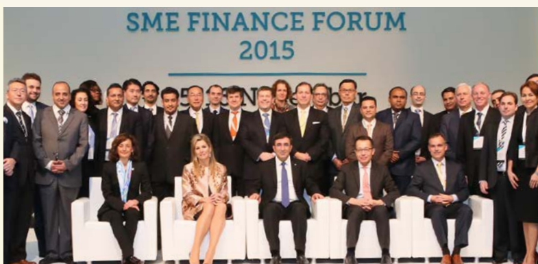
With a keynote address from the Special Advocate, the SME Finance Forum launched a global membership network to help small businesses learn from each other. Antalya, Turkey, November 2015.