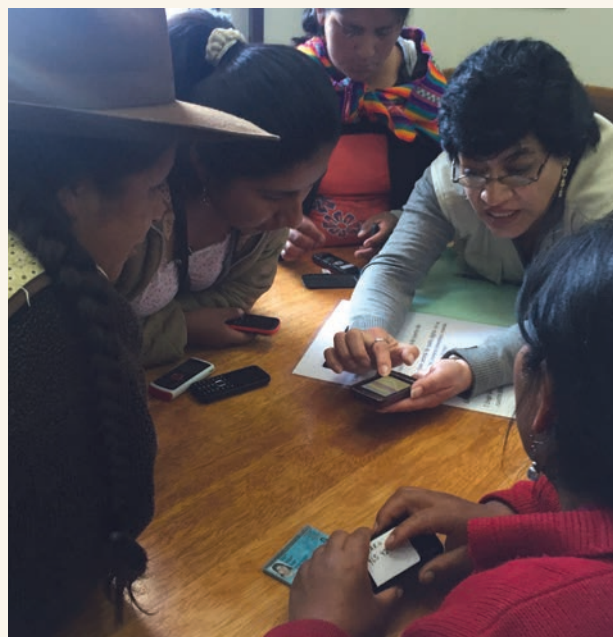
Peruvians learn how to use the country's national mobile payments system, launched in 2016.

Rising inequality within borders and between nations remained a focus of much discussion this year. “We need sustainable economic development and growth in which everyone can participate,” the Special Advocate emphasized in a speech to European finance leaders at the informal Ecofin meeting. “Financial inclusion is one of the means towards achieving this goal.”