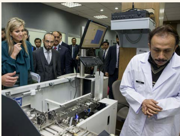
NADRA, Pakistan's national biometric ID, is an important key to expanding financial access. The UNSGSA visited the NADRA center in February 2016 to learn how the system's technology works.

If handled right, fintech could help draw in the previously unbanked with better, easier to use products. As such, the field warrants close attention—including a sharp eye to risks for low-income customers. Promoting a constructive dialog between the standard-setting bodies, regulators, and fintech companies will be crucial to ensure that innovation is not stifled by regulation and that customers are protected. Fintech, like financial inclusion, should be a means to an end, the UNSGSA has said—and that end is to improve people's lives and further vital development goals.