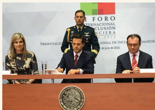
Mexico launched its financial inclusion plan in June 2016 at an event attended by the UNSGSA, along with President Enrique Peña Nieto (center) and Finance Minister Luis Videgaray (right).

Organizations that work closely with national governments have also expanded their impact this year. In early 2016 the Alliance for Financial Inclusion, a network of financial policymakers that supports planning, strategy, and regulatory reform, came fully into its own as an independent, member-supported organization. And the Better Than Cash Alliance, which accelerates the transition from cash to digital payments, gained commitments from India, Pakistan, Mexico, Benin, Sierra Leone, and Moldova to move towards a stronger digital economy as a way to lower costs and expand financial inclusion.