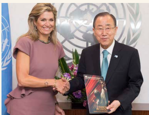
Queen Máxima as the Secretary-General’s Special Advocate for Inclusive Finance for Development presented her 2015 Annual Report to Secretary-General Ban Ki-moon at the UN, September 2015.

“The financial resilience of consumers is essential on a macro level. It lays the foundation for stability and economic growth.”